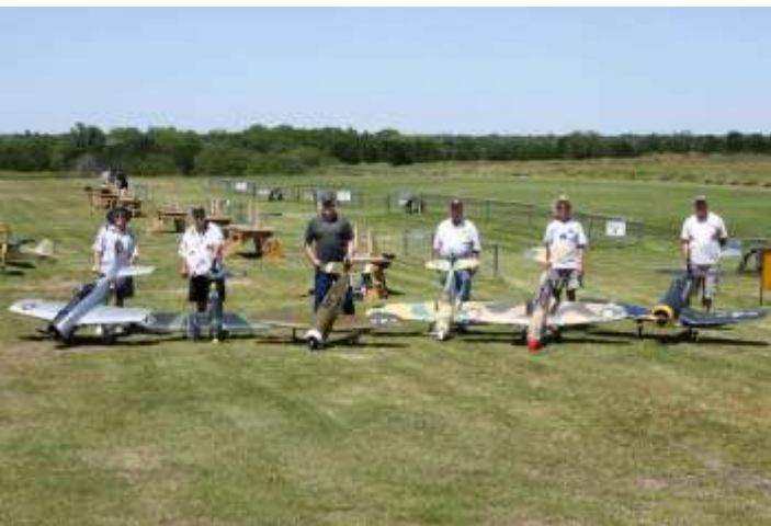
Greater Southwest Club Day at the field #1