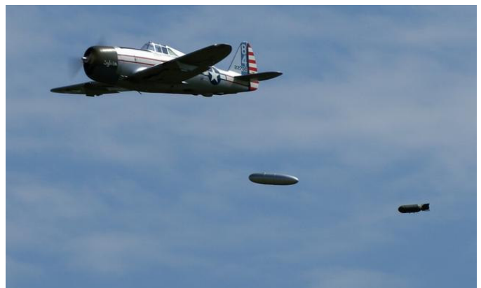
Lawrence’s Yellow Aircraft Thunderbolt Robart retracts, Brison 4.2

Roly Worsfold rolydd@telus.net 250-374-4405