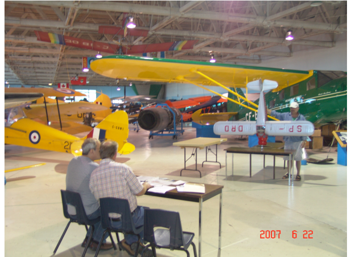
Static Judging at Alberta Scale 2007 in the Edmonton Museum

2008 looks to be a very good year and I am looking forward to participating in all the "qualifiers" in our area.